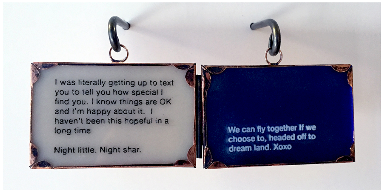
MESSAGE RECEIVED (detail) 2015

An opening reception for the artist will take place at Heller Gallery, on Thursday, March 5, 2015 from 6-8pm.