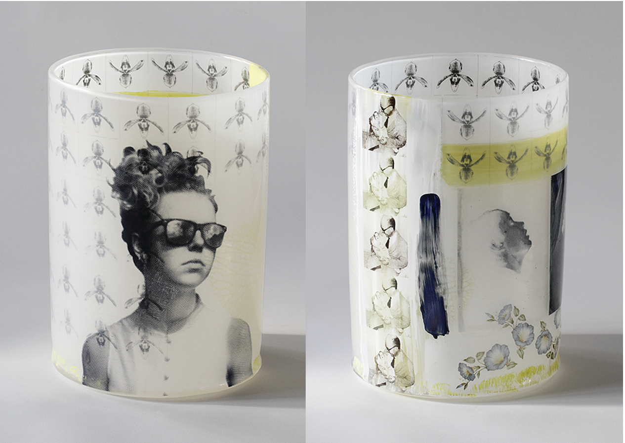
CONSIDER THE ORCHIDS , 2016, glass/enamels, 13 x 10 x 10 in.