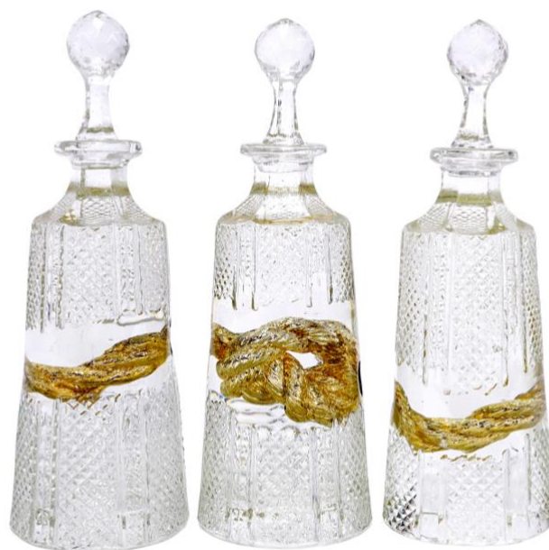
THE GOLDEN THREAD (HEX DECANTERS) , 2019, cast crystal/24 carat gold mirror, 11 x 11 x 3 1/2 in.

Please call (212.414.4014) or email us ( info@hellergallery.com ) to make an appointment.