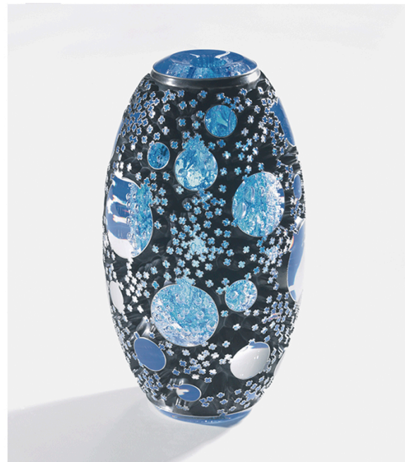
ENIGMA STAR X, glass/copper, 8 ½ x 5 x 5 in.

Heller Gallery is pleased to present Squaring the Circle , Michael Glancy's first exhibition in New York since 2013. Thirteen new pieces will comprise the exhibition.