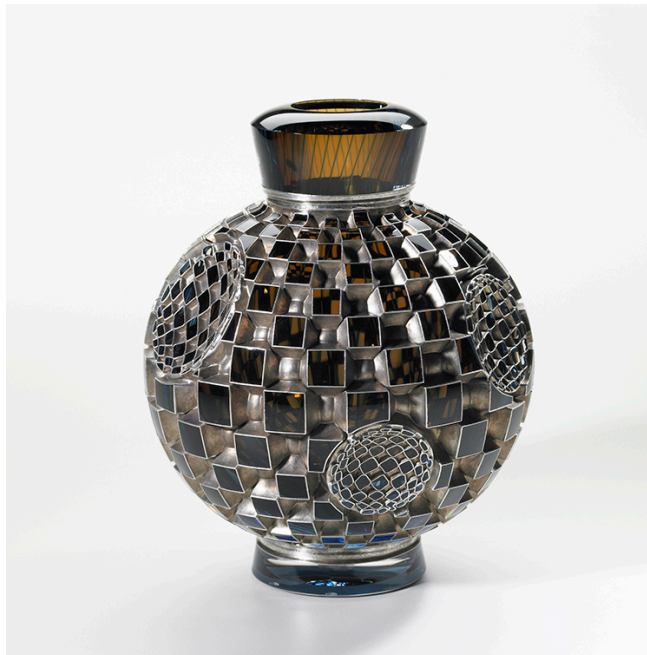
STEEL LINE BUCKYBALL, glass/copper/silver, 8 x 6 ½ x 6 ½ in.

Artist reception: Thursday, April 20, 6-8pm