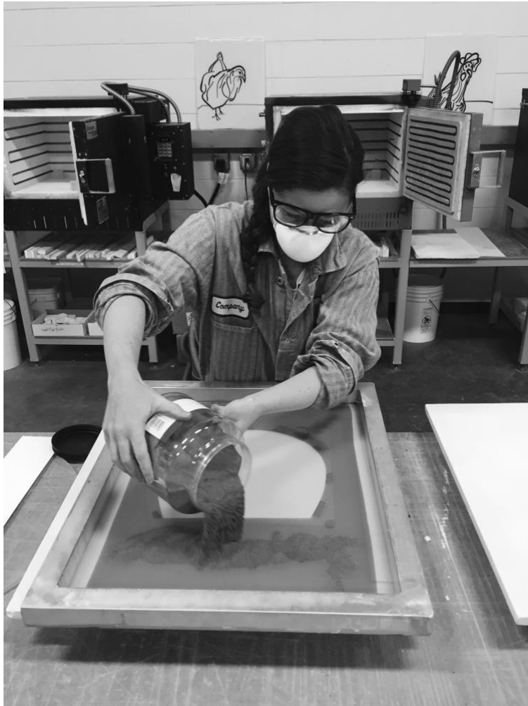
I set the screen onto a kiln shelf in the kiln.