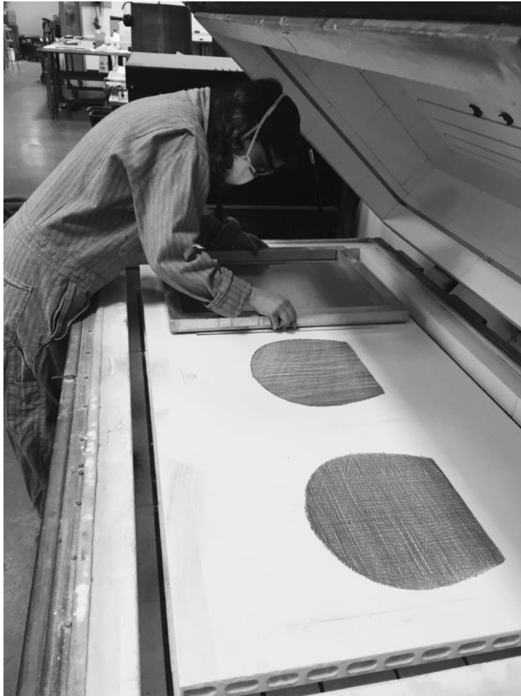
I remove the screen, leaving the glass on the shelf.