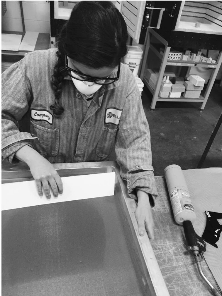
I run fine glass powder over the screen, the glass powder falls through the screen onto the shelf, following the lines of my drawing.